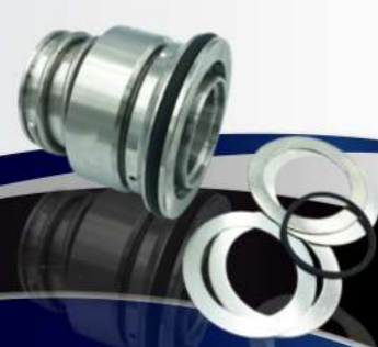
*SUMP PUMP CARTRIDGE