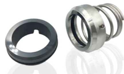
*SB 3/CA @ *SB 3/ST