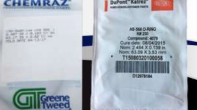
KALREZ ORING N CHEMRAZ ORING