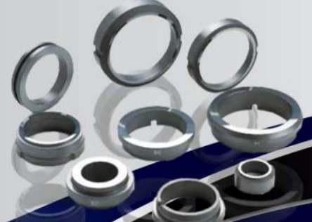
*SOLID SILICON RING & *TUNGSTEN RING