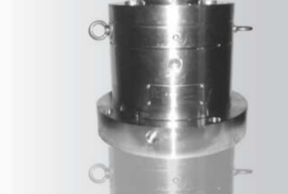
*SB/070 AGITATORS SEAL