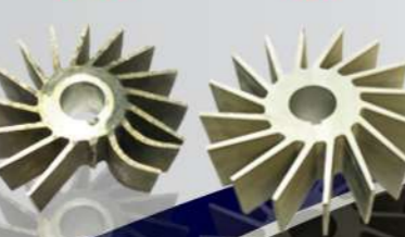
VACUUM PUMP IMPELLER