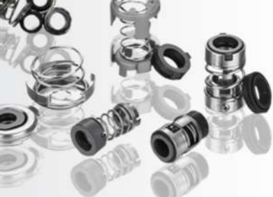
*SB/LGF (OEM SEAL)