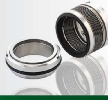
*SBF 86/B & *SB 608/J