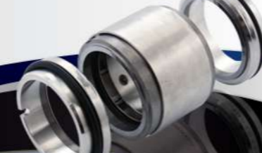
*SB-74 DOUBLE SEAL