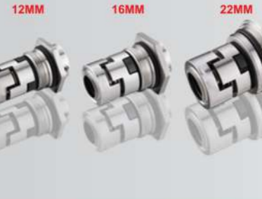
*SBLF-G (OEM SEAL)