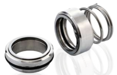
*SB 32/TC *SB32/SC